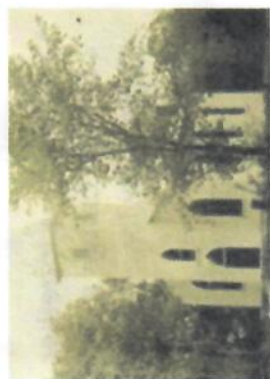
St. Paul's circa 1811

With a history of shared use between multiple congregations, St. Paul's was a cornerstone of life in Delta and played an important part in the history and development of the village.